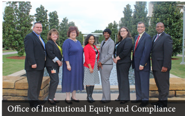
Office of Institutional Equity and Compliance