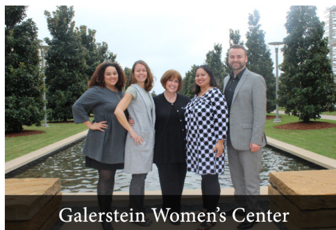
Galerstein Women's Center