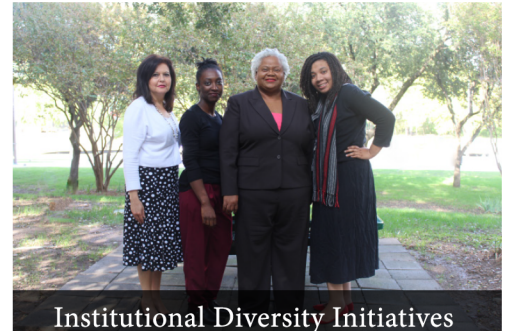
Institutional Diversity Initiatives