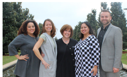
Galerstein Women's Center

Physical Location: Administration Building AD 3.207 Phone: (972) 883-4566 Fax: (972) 883-4565