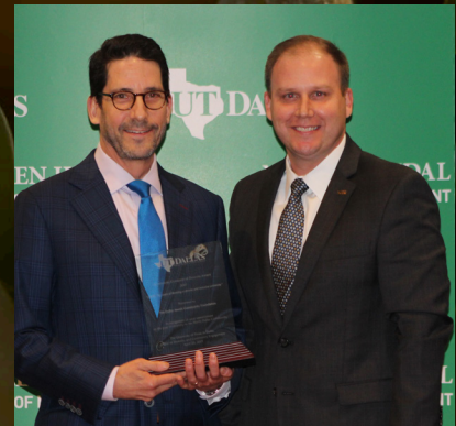
Community Champion of Diversity Award Dallas Jewish Community Foundation