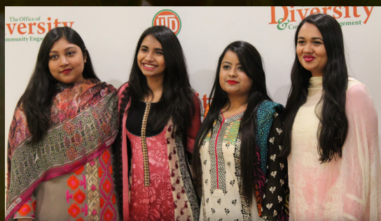
Bangladesh Student Organization