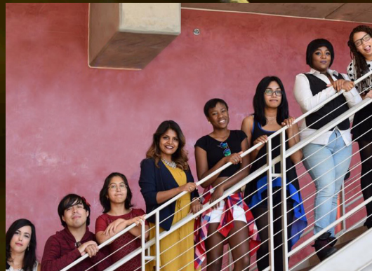
Student Organization Diversity Award Hallyu