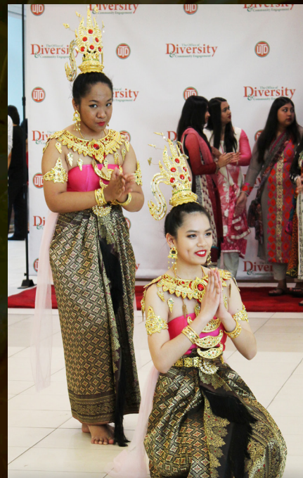
Chao Phra Ya - Thai Dance