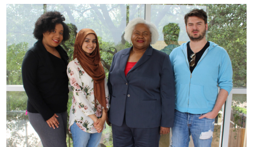
Institutional Diversity Initiatives