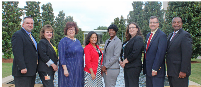
Office of Institutional Equity and Compliance