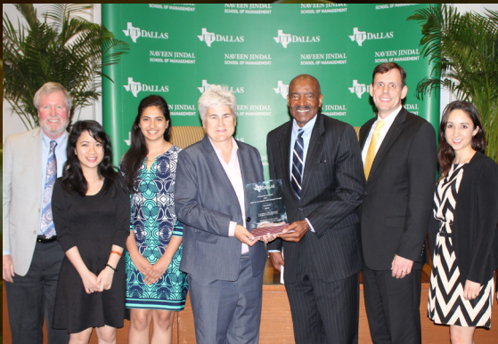
Corporate Diversity Award Deloitte