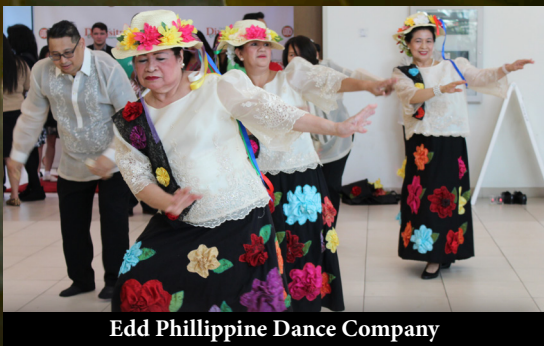
Edd Phillippine Dance Company