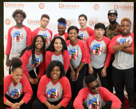
Theta Nu Sigma Step Team-Garland High School